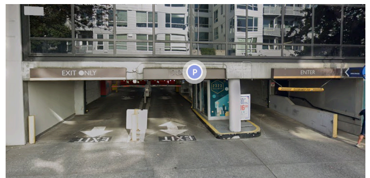
Above: Entrance to Bell Street Pier Garage at 2323 Elliott Avenue