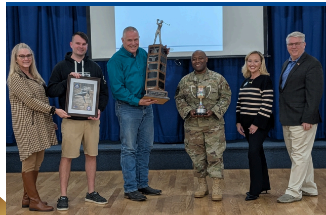
2024 Robins Mission Partner Challenge Champions: AFLCMC/HBY Electronic Warfare System Program Office